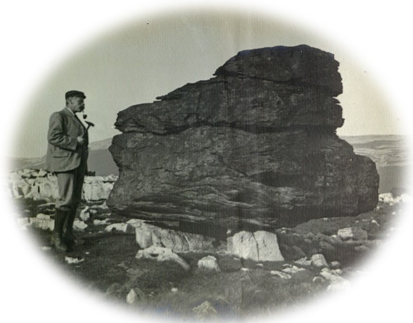
Photograph from an excursion by the Bradford Scientific Association [33D86/3/1-2]

MEANWOOD ALLOTMENT RECORDS WYL2182 Minutes and some accounts with ploholders at Jackson's allotment gardens 1877-1956